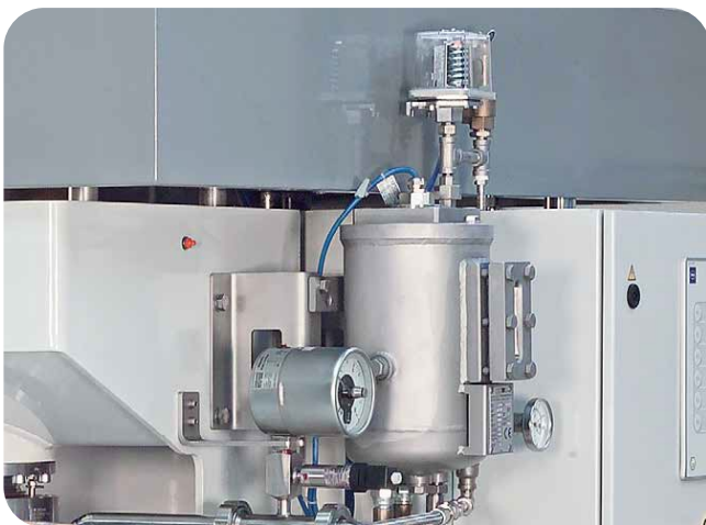
Barrier fluid reservoir before rebuilding

To minimize the probability of mechanical seal failure, the temperature of the sealing liquid can be monitored. To prevent consequential damage, the machine is switched off if the temperature of the sealing liquid is too high, thus protecting the mechanical seal from overheating.