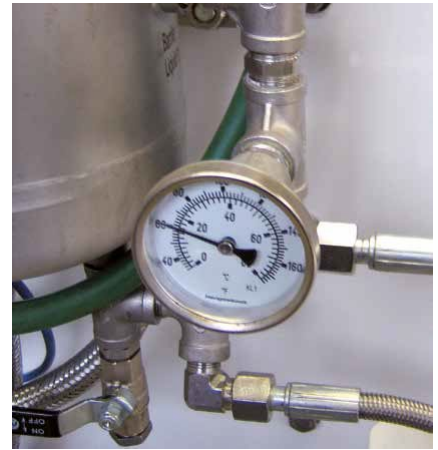
Optional temperature monitoring

The conversion of the barrier fluid reservoir and of the sealing pressure monitoring system can be carried out directly by you. For the optional temperature monitoring, we recommend one of our service technicians.