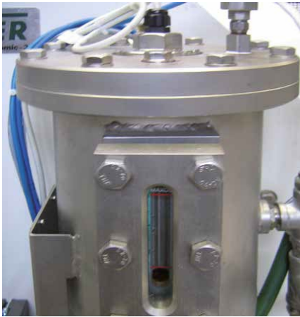
Barrier fluid reservoir with float switch