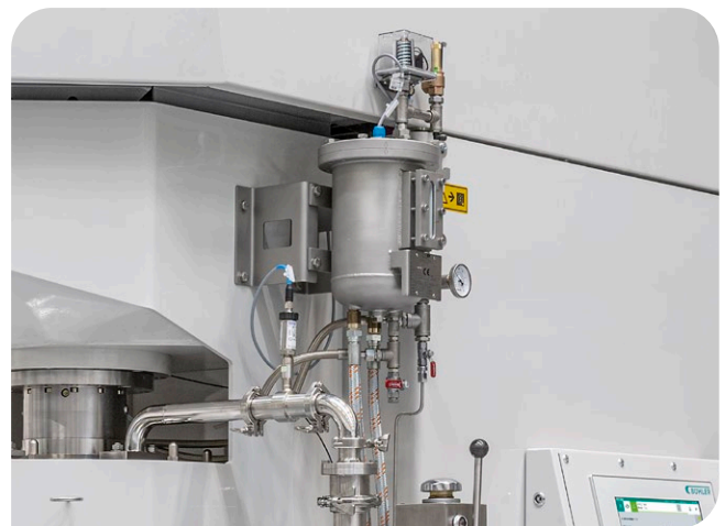
Barrier fluid reservoir new design and flanged