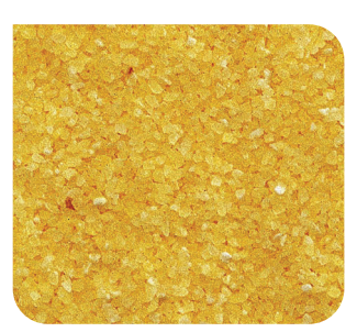
Pure semolina for highest quality standards.